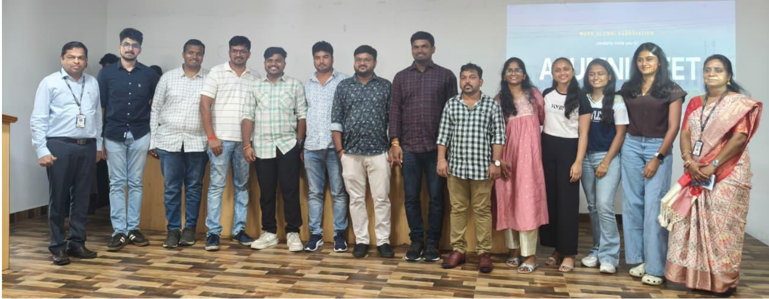
Alumni group photo with HOD & Alumni Coordinator