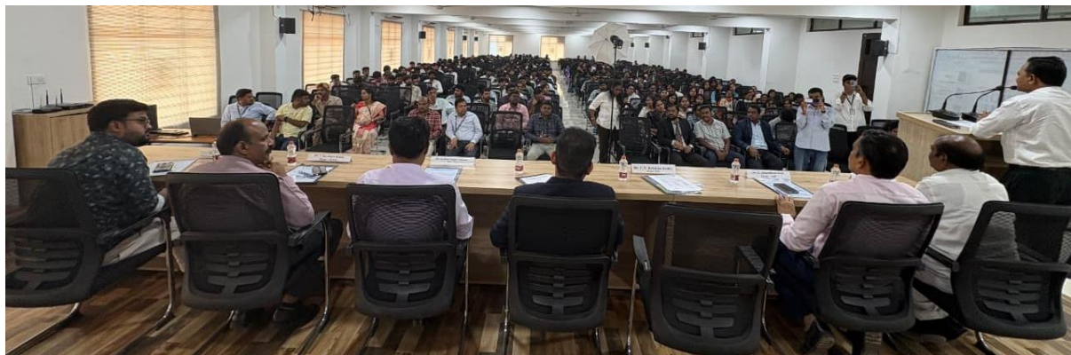
Glimpses of Alumni Meet